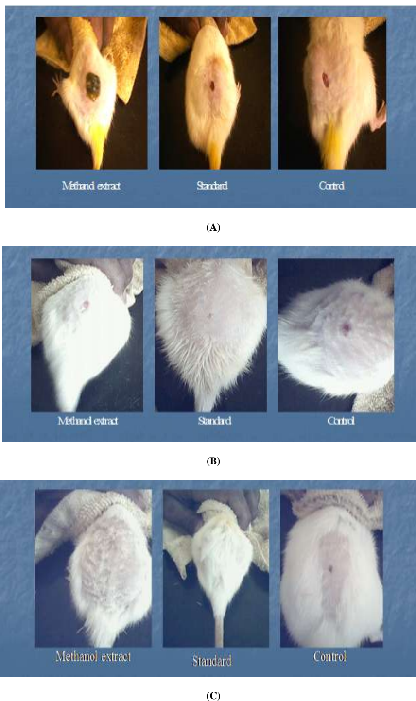
Fig 2. Excision Wound Model on (A) 0 Day, (B) 8 th Day and (C) 16 th Day

day onwards. In 5% (w/w) extract-ointment-treated mice, the wounds were completely healed (epithelization period) in 16 \pm 2 days whereas in the control animals it took more than 20 \pm 2 days. On day 12, standard-ointment-treated wound was completely healed while extract-ointment-treated wound was also almost at complete healing stage. It was also observed that epitheliazation period of treated and standard group