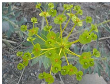
Fig 1. Euphorbia leaves