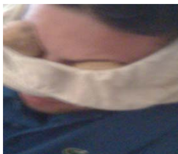
Fig 3. Eye covering with halves of potato

also known to have a remedy for inflammation of the respiratory tract in asthma as it has a special reputation for causing bronchial relaxation [10]. The plant shows antibiotic activity as well [11]. The alcoholic extract of the whole plant had an anti-cancer action against Friend leukaemia virus in mice [12]. It further showed hypoglycaemia action in albino rats and an antiprotozoal effect [13]. The plant has also been shown to have anthelmintic activity [5, 11, 14]. The use of latex on warts, whitlows and the like is worldwide [15]. Recently antibacterial and anti-inflammatory activities of E. heterophylla and E. hirta were reported [16-19]. The website: http://www.euphorbia-international.org/ of International Euphorbia Society covers much more information about the Euphorbiae .