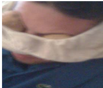
Fig 3. Eye covering with halves of potato

also known to have a remedy for inflammation of the respiratory tract in asthma as it has a special reputation for causing bronchial relaxation [10]. The plant shows antibiotic activity as well [11]. The alcoholic extract of the whole plant had an anti-cancer action against Friend leukaemia virus in mice [12]. It further showed hypoglycaemia action in albino rats and an antiprotozoal effect [13]. The plant has also been shown to have anthelmintic activity [5, 11, 14]. The use of latex on warts, whitlows and the like is worldwide [15]. Recently antibacterial and anti-inflammatory activities of E. heterophylla and E. hirta were reported [16-19]. The website: http://www.euphorbia-international.org/ of International Euphorbia Society covers much more information about the Euphorbiae .