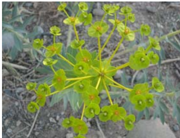
Fig 1. Euphorbia leaves