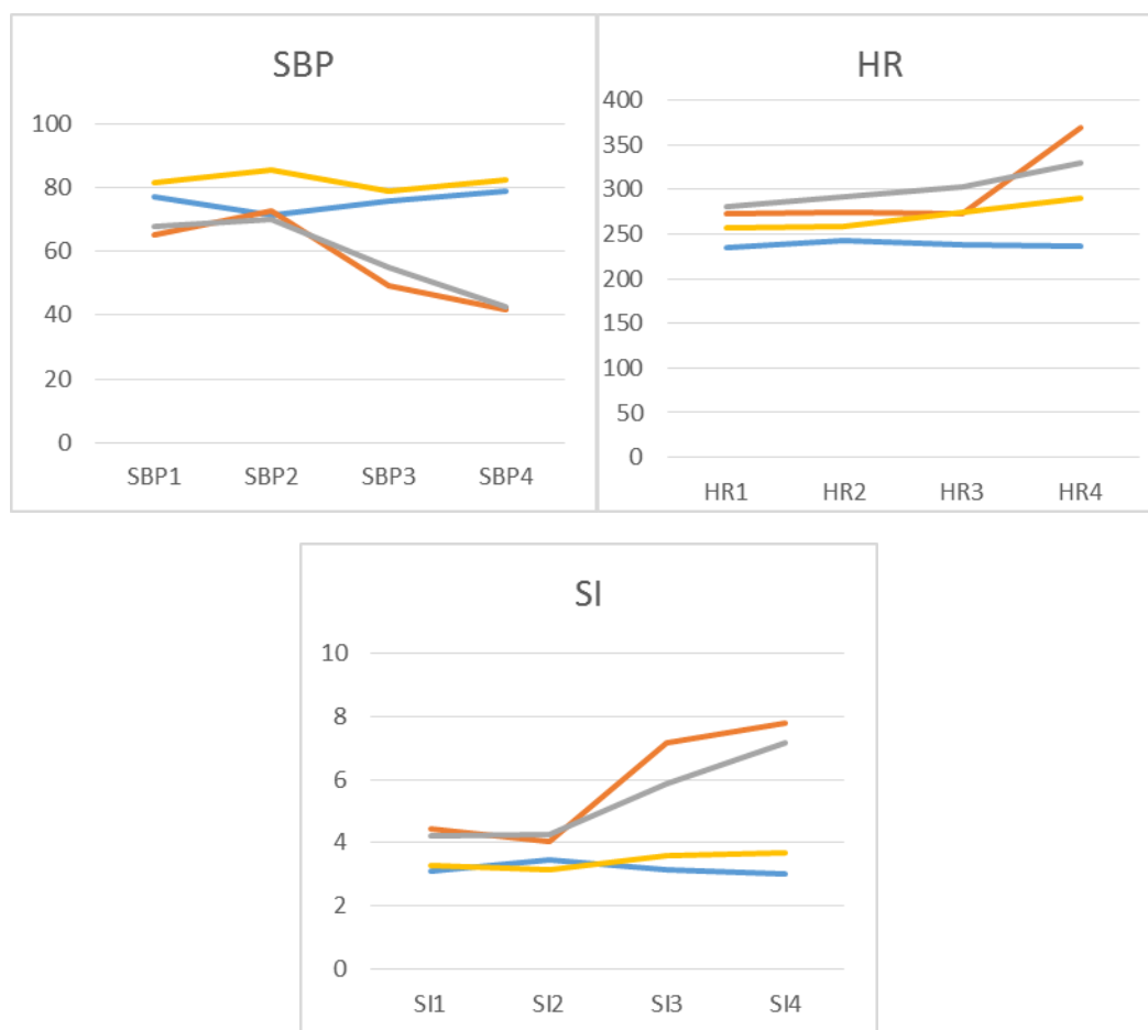
Figure 1. Hemodynamic parameters among the four groups. The mean±standard error of the mean.

The hemodynamic parameters, including SBP, HR, and SI among the treatment groups are shown in Fig. 1. The changes in hemodynamic parameters are seen in the four-